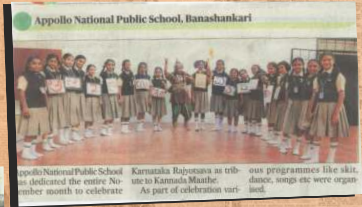
Appollo National Public School, Banashankari has dedicated the entire November month to celebrate Karnataka Rajyotsava as tribute to Kannada Maathe. As part of celebration various programmes like skit, dance, songs etc were organised.