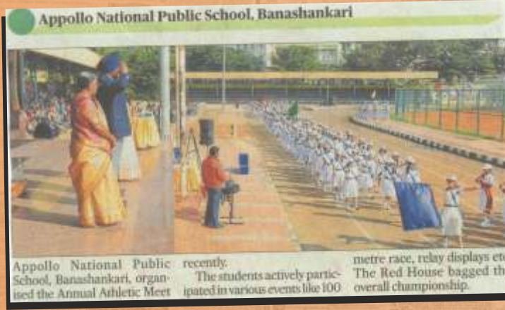
Appollo National Public School, Banashankari, organised the Annual Athletic Meet recently. The students actively participated in various events like 100 metre race, relay displays etc. The Red House bagged the overall championship.