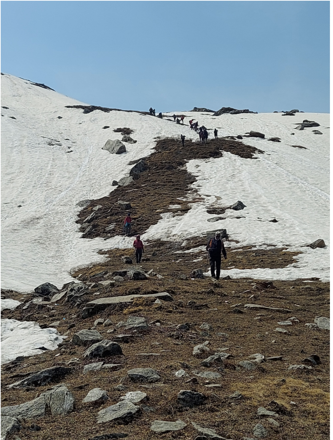
Our group descending down the Kedarkantha peak...