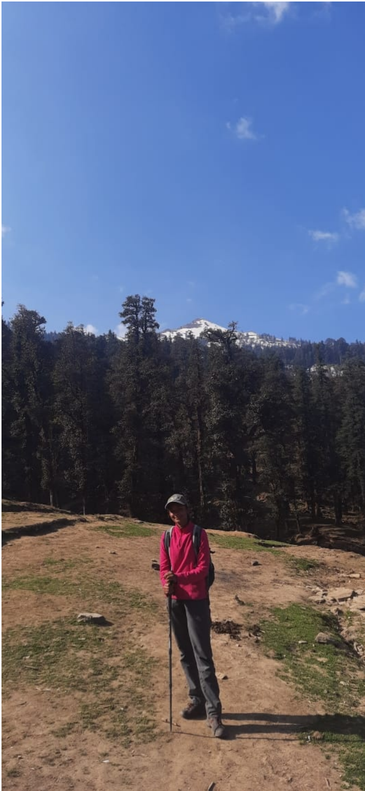
Standing in front of the summit!