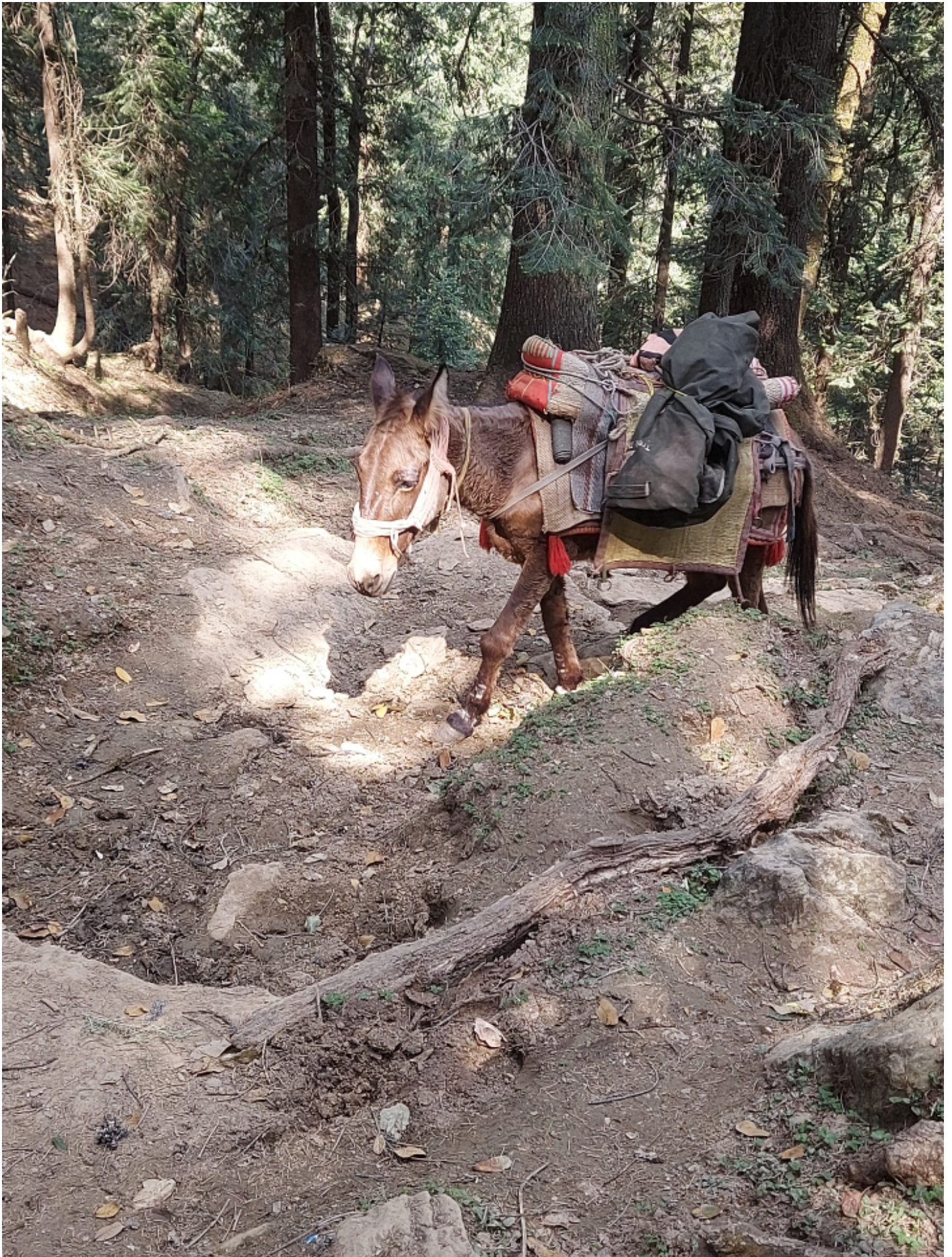
Mules which carried our offloading backpacks