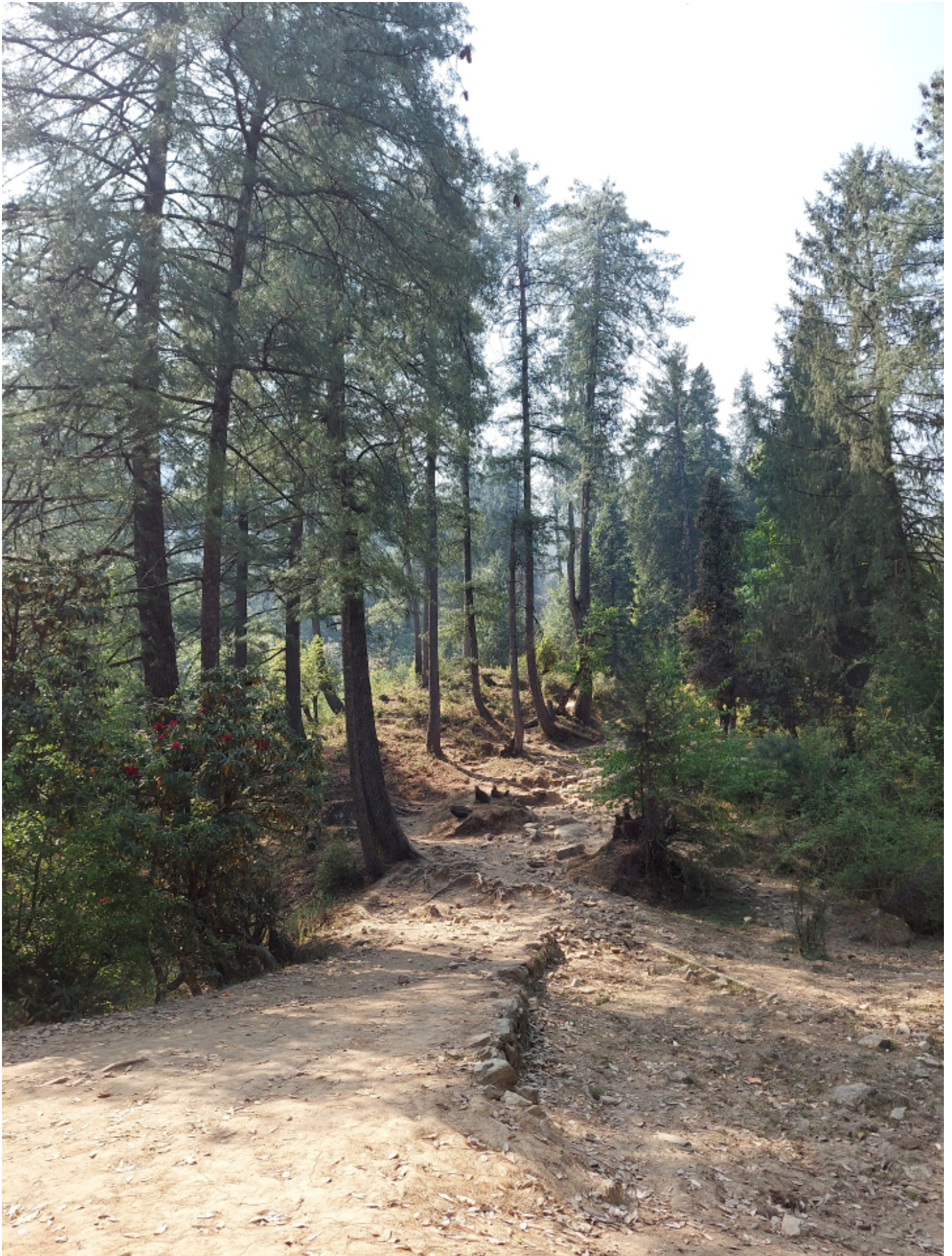
Pine trees all along the trail...