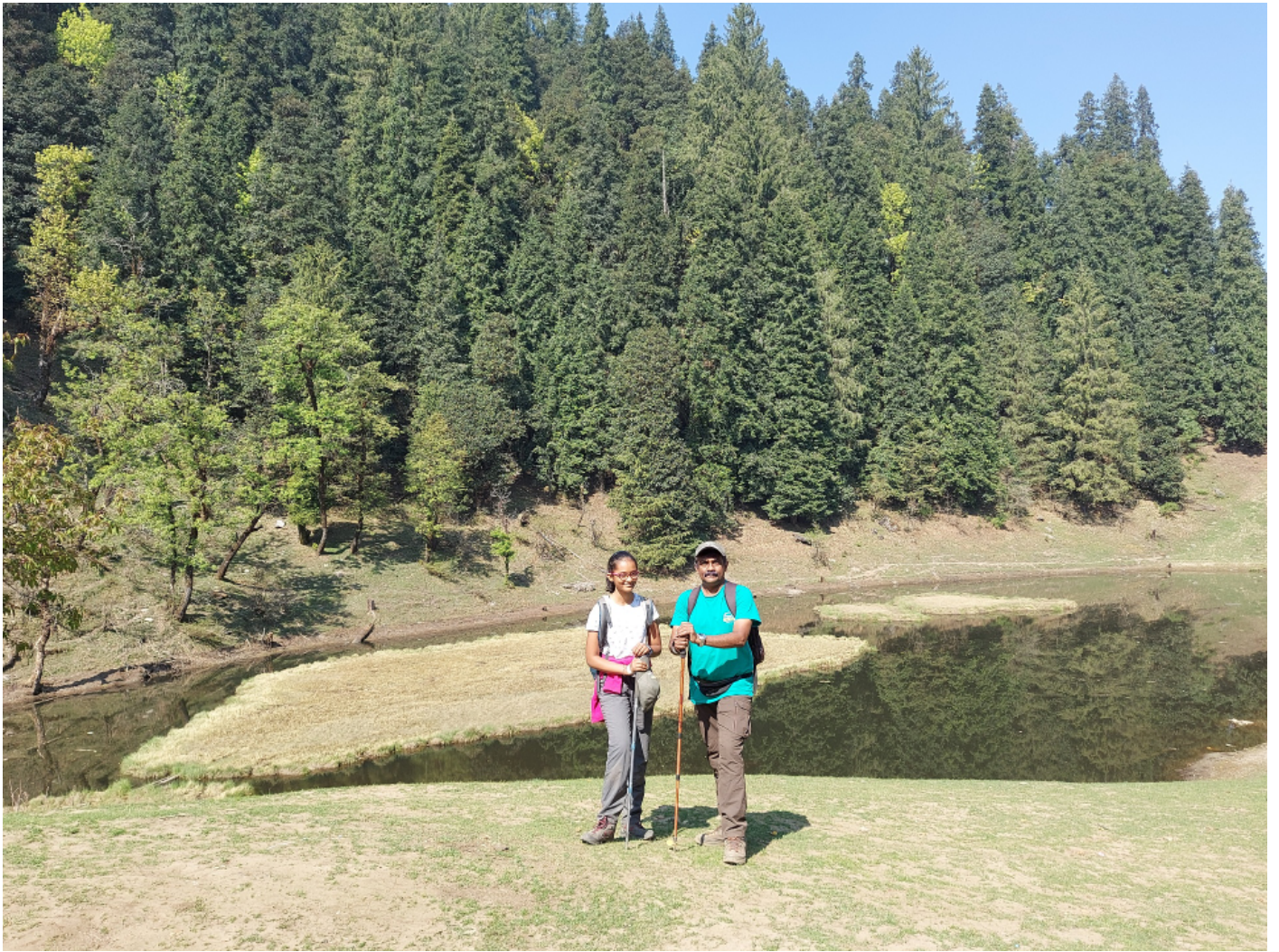
Behind us you can see "Juda ka talab" lake