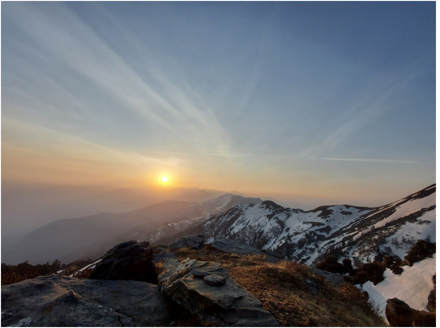
Sky turning from dark to gold Breath-taking view!!!